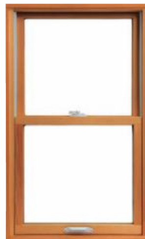
Series/Style: ProLine Product: Double-Hung Window Color/Finish: Natural finish interior Hardware: Standard Champagne