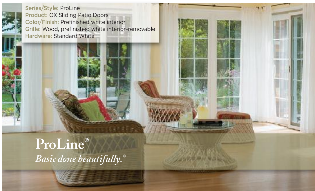
Series/Style: ProLine Product: OX Sliding Patio Doors Color/Finish: Prefinished white interior Grille: Wood, prefinished white interior-removable Hardware: Standard White

* Some Pella products may not meet ENERGY STAR guidelines in Canada. For more information, contact your local Pella representative or go to energystar.gc.ca .