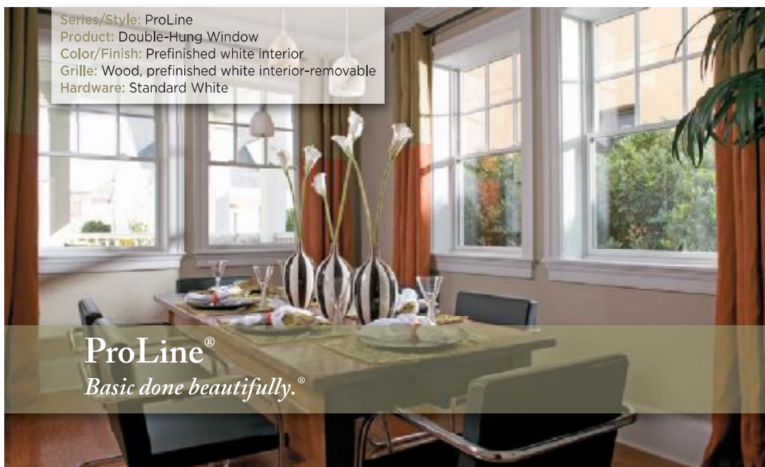
Series/Style: ProLine Product: Double-Hung Window Color/Finish: Prefinished white interior Grille: Wood, prefinished white interior-removable Hardware: Standard White

* Some Pella products may not meet ENERGY STAR guidelines in Canada. For more information, contact your local Pella representative or go to energystar.gc.ca .