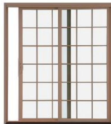
Series/Style: ProLine Product: OX Sliding Patio Door Color/Finish: Natural finish interior Grille: Wood interior-removable Hardware: Standard Champagne

When room is tight, sliding patio doors are just right. They don't swing, so they require less floor space than a hinged door. From kitchen to bedroom, and from traditional to contemporary, they're perfect for your home's style, too. Pella ProLine® is a beautiful collection of patio doors with our most popular choices — including a wide range of standard sizes, shapes, and styles.